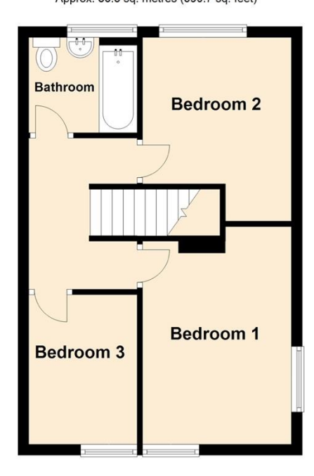
Total area: approx. 81.9 sq. metres (881.8 sq. feet)