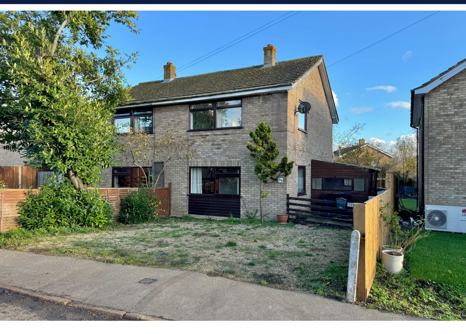
59 High Street